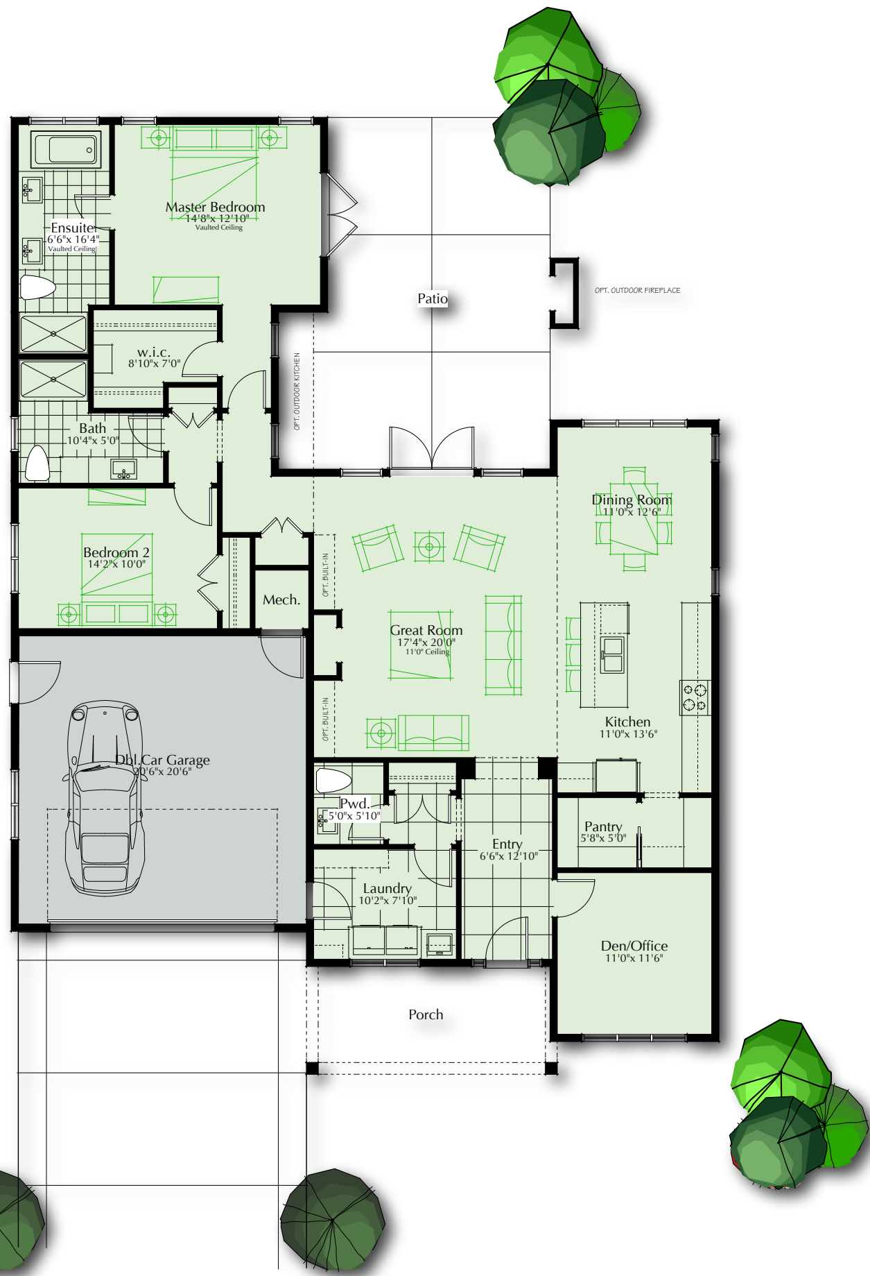
THE MANNING 1914 sq. ft.